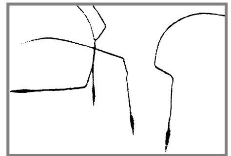
Figure 2: Stipa seed showing the lemma at the base attached to the bigeniculate (twice bent) awn.

The most common grasses found (and planted) around Melbourne include various species of Danthonia (Wallaby-grasses), Poa (Tussock-grasses), Stipa (Spear-grasses) and Themeda triandra (Kangaroo Grass). The basalt plains to the north and west of Melbourne contain genera and species not found elsewhere around Melbourne. e.g. Dicanthium and Enneapogon .